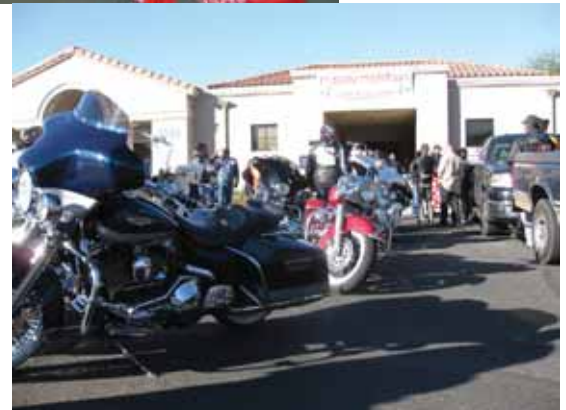
Thank you to the Sun Riders motorcycle club for your annual Christmas eve donation! The kids in the shelter loved looking at your motorcycles!