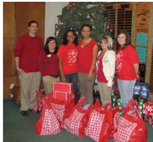
The staff at the Target Store on Old Spanish Trail made a trip to Casa with lots of toys for the kids... thanks!!