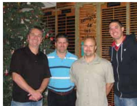
Thanks to the local Chilis Restaurants for the huge holiday donation!