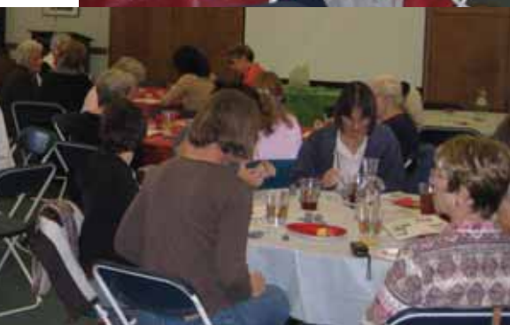
Volunteers had a team building event in January where they enjoyed lunch and constructed bells for the Ben's Bells organization